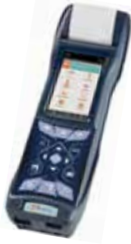
COMBUSTION GAS ANALYZER KIT BTU1500 ..... $1,425.00 ALL-IN-ONE COMBUSTION AND GAS ANALYZER