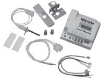
SILICON NITRIDE UPDATE KIT 21D64-2 .....$25.00 120V