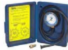
GAS PRESSURE TEST KIT 78060 ..... $46.95 0-35"