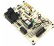
DEFROST BOARD ICM321C .....$36.95 30/50/9024V BRYANT CES0110063+