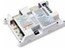
HOT SURFACE IGNITION CONTROL 50A55-843 .....$99.00 UNIVERSAL INTEGRATED FURNACE CONTROL