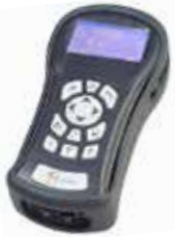
RESIDENTIAL COMBUSTION ANALYZER KIT BTU900-HE ..... $999.00 EMISSIONS AND COMBUSTION ANALYZER, ECONOMY