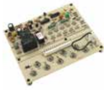
DEFROST BOARD ICM320C .....$47.50 30/50/90MIN 24V BRYANT HK32FA006