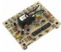
DEFROST BOARD ICM301C .....$17.25 30/60/90MIN 24V RHEEM, DFOSP24A2