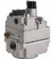
GAS VALVE 36C03-300 .....$80.00 1/2"X 3/4" 24V