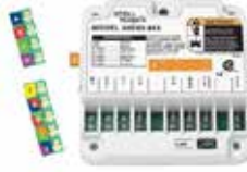
SPARK IGNITION CONTROL 50D50-843 .....$105.00 UNIVERSAL PROVEN PILOT