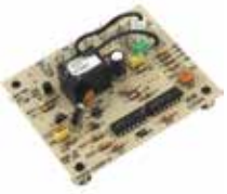
DEFROST BOARD ICM300C .....$17.25 30/60/90MIN 24V CARRIER, LENNOX