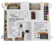
FURNACE CONTROL KIT 50M56U-843 .....$115.00 UNIVERSAL HSI