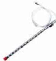
WATER MANOMETER 78075 ..... $25.00 15"